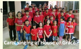
Carol singing at House of Grace