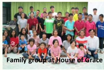
Family group at House of Grace

In 1991 they responded to a new challenge. On World AIDS Day (1 st December) they read the frontpage news in the English Bangkok Post that “500,000 were already HIV infected” and this number could rise to two million by the year 2000. They were deeply